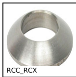
Spherical tilt washer - DIN6319, convex