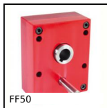
Offset spur gear reducer, from 111 to 425 Nm