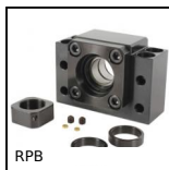
Ball screw bearing unit, Support