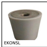
Silicone conical elastomer buffer, Female mounting