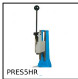
Manual workbench press, Force up to 500kg