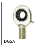
DGSA Male rod ends , Steel / steel - Economy range