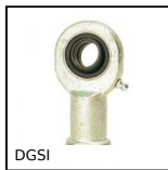
DGSI Female rod ends, Steel / steel - Economy range