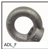
ADL_F Female eye bolt conforms to DIN582, Steel