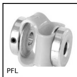
P-FLEX Coupling, Set screw