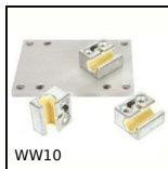
Drylin® W slide, slide assembly