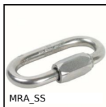
Stainless steel Quick link, Stainless steel