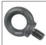
Steel eye bolt