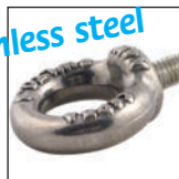
Stainless steel eye bolt