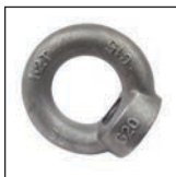
Steel eye bolt