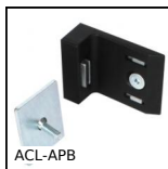
ACL-APB Closing system for aluminium profile, Magnetic door stop