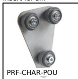
PRF-CHAR-POU Tool holder for aluminium profile, Moveable tool holder