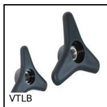
VTLB Three-lobed knob, Thermoplastic / Brass or stainless steel