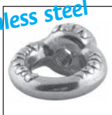
Stainless steel eye bolt