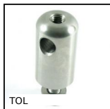
TOL Swivel head, Long