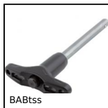
BABTss 303 Stainless steel ball pin, 303 Stainless steel