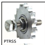
PTRSS Idler chain sprocket, For hostile environments