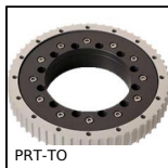
PRT-TO igidur® slewing ring, With external teeth- Iglidur®, aluminium & S...