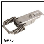
GP75 Spring loaded toggle latch, Standard (GP75)