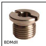
BDMdl Magnetic bush for pin, Fast and light magnetic locking