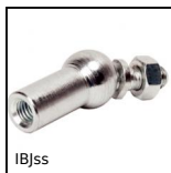
IBjss Ball and socket joint, Stainless steel