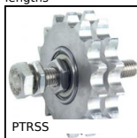
PTRSS Idler chain sprocket, For hostile environments