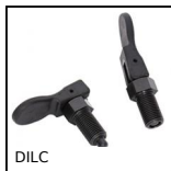
DILC Indexing plunger with cam, with cam