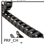
PRF_CH Cable-carrier chain for aluminium profile, Supplied in metre lengths