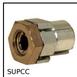
Self-centering clamping hub steel, With lock nut