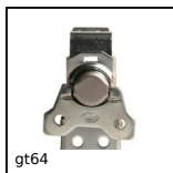
gt64 Rotating bent lever, Common applications