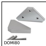
Connecting kits, XZ linking kit