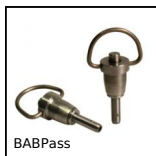
BABPass Hardened stainless steel ball pin with ring, With grip ring