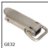
Sprung toggle latch with connecting link, Standard