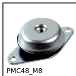
Anti-vibration machine mount, Oval base plate