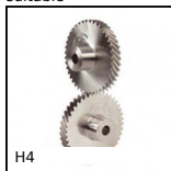
H4 Crossed helical gear crossed axis at 90°, Steel 20NCD2