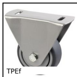
Castor for aluminium profile, Fixed