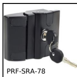
Lock for aluminium profile, Quick fitting, self locking door lock