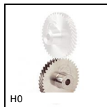
Crossed helical gear crossed axis at 90°, Steel 20NCD2