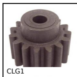
Moulded plastic spur gear, Moulded plastic (nylon)