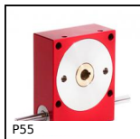
Worm and wheel gear reducer, up to 57 Nm