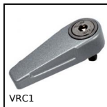
VRC1 Retaining clamp, single sided, Single sided