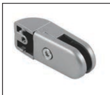
ACL-FPA-BM + ACL-FPA-RA