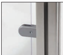
Typical application ACL-FPA-BM