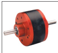
J, XJ range