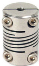
SINGLE PIECE COUPLINGS