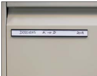
Example of an application on an office filing cabinet