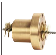
Deburring a trapezoidal nut